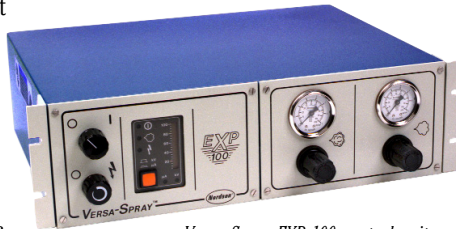
Versa-Spray EXP-100 control unit

A bright dual-function LED bar graph continuously displays either KV set point or micro amp current output. The display can easily be seen from a distance, providing operators with operational and diagnostic information at a glance.