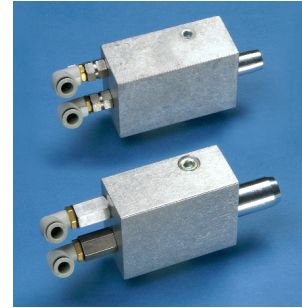
Nordson powder pumps for LF-10 gun (top) and HF-10 gun (bottom).

Nordson high-performance powder pumps utilize a venturi principle to deliver powder from a supply hopper to Nordson powder spray guns. Pumps and powder delivery tubing for pipe coating applications are sized according to either the LF-10 or HF-10 gun. Powder contact parts are made of specially engineered materials for increased resistance to wear and powder impact fusion. Pump operation is controlled by the Nordson Versa-Spray EXP-100 control unit.